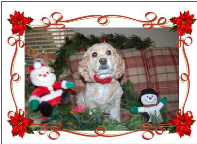
Your own photo