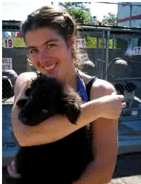
A HandsOnUSA volunteer snuggles a puppy