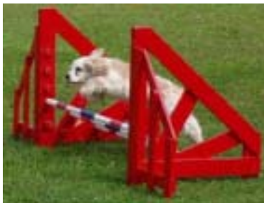
"Darby" of New York is a rescue dog who lives for the sport.