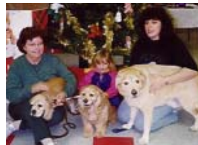
Family portrait: Duchess, Genji and Ryker with "their girls", December 2001