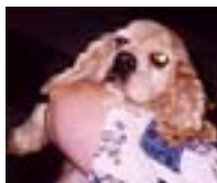
Duchess, in rescue

At the age of ten, Genji was dumped at the vet's. The owner was "done with her" and requested that the vet put her to sleep. Unable to kill a healthy animal on a whim, he called OBG. A month later, on the other side of the Potomac, a landlord went to clean out an empty apartment and found Duchess. She had been abandoned there for two months when the previous tenant vacated. How Duchess survived isn't clear, but the animal control officer and the rescuing veterinarian prosecuted the former owner for animal neglect and cruelty. The vet cleaned up her severe mats and the toenails grown into her foot pads. Nothing could be done to save the vision in her one eye—it was lost due to an untreated trauma. OBG had her spayed and brought current on shots, then started looking for a home for her.